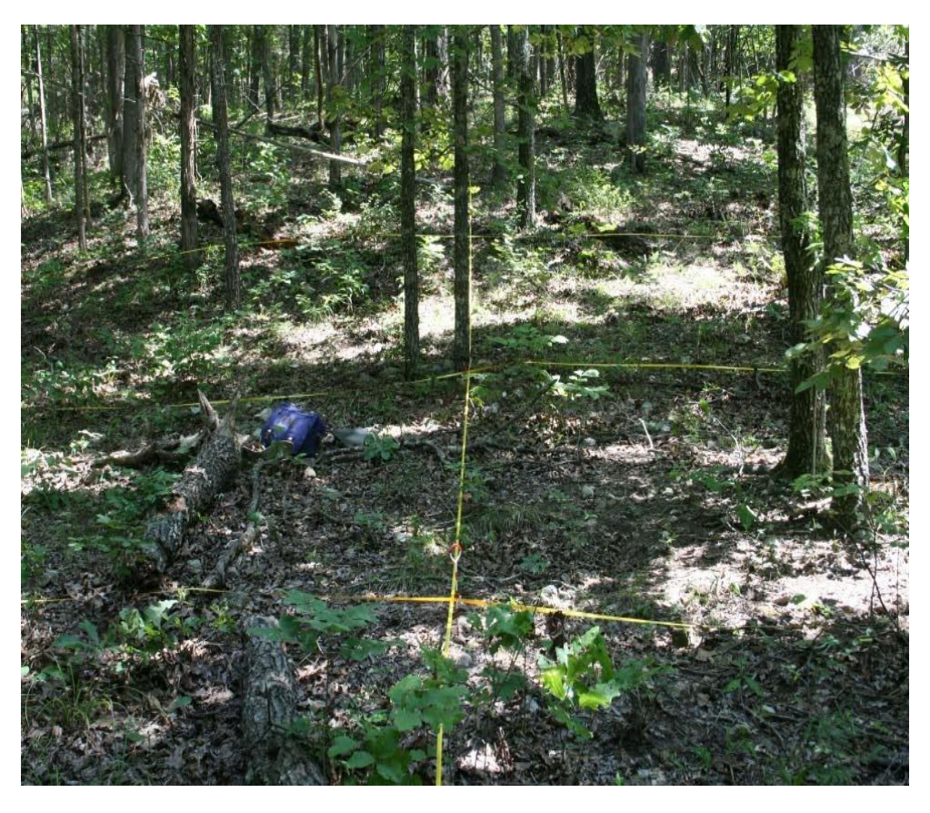
Fig. 2. A main burned Pruitt study plot (10 m by 10 m) with nested plots (subplots).