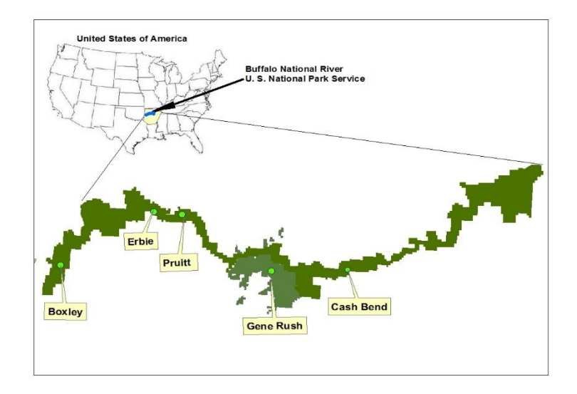
Fig. 1. Map of study cite.

numbers table. Each larger plot also contained sixteen 1 m by 1 m nested plots (delimited with a sampling frame), with four nested plots in each of the four 5 by 5 m subplots. The nested plots were used to obtain cover values for herbaceous plants (forbs and graminoids), bryophytes and lichens. Cover values were determined with the use of the cover class rating scale described by Daubenmire (1968). Any additional species of vascular plants not encountered within the nested plots but observed to be present within larger 10 by 10 m plot were recorded. Later, data collected in the field were used to calculate values of relative abundance (stems <2.5 cm DBH), relative cover (herbaceous plants, bryophytes and lichens) and importance value indices (stems \geq 2.5 cm DBH) in the manner described by Stephenson and Adams (1986). Nomenclature used herein follows the Checklist of the Vascular Plants of Arkansas (Gentry et al. 2013). Jmp statistical software, important values and chi-square were used to analyze data for significant differences between the burned and unburned sites.