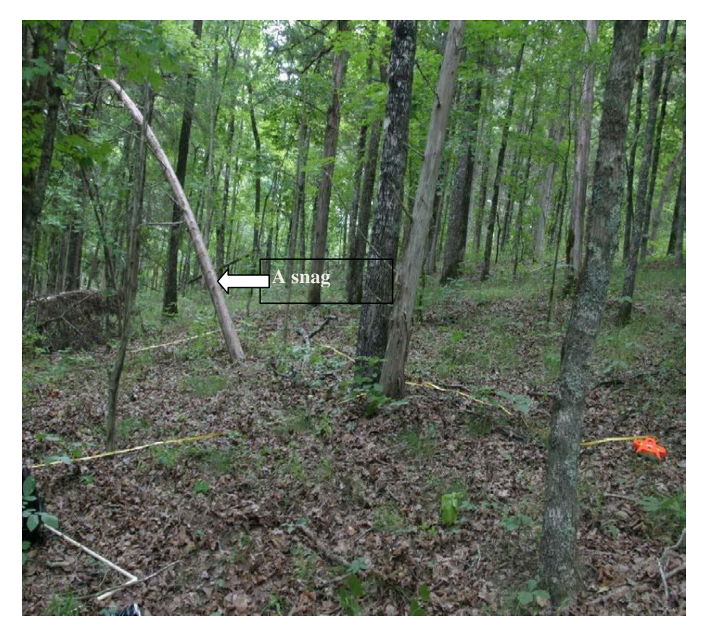
Fig. 3. A main unburned Pruitt study plot (10 m by 10 m) with nested plots (subplots).